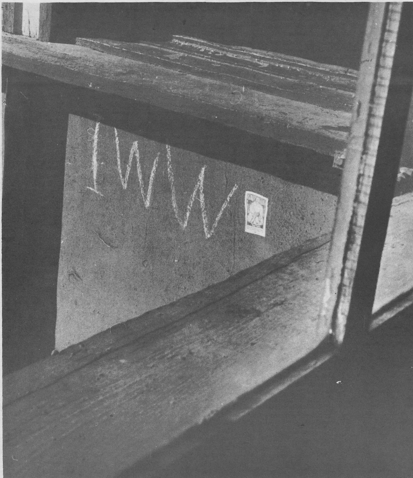
POUGHKEEPSIE, NEW YORK (WNS) The RR Station in this lovely Hudson River town is undergoing a redecoration process from certain civic minded Poughkeepsians.